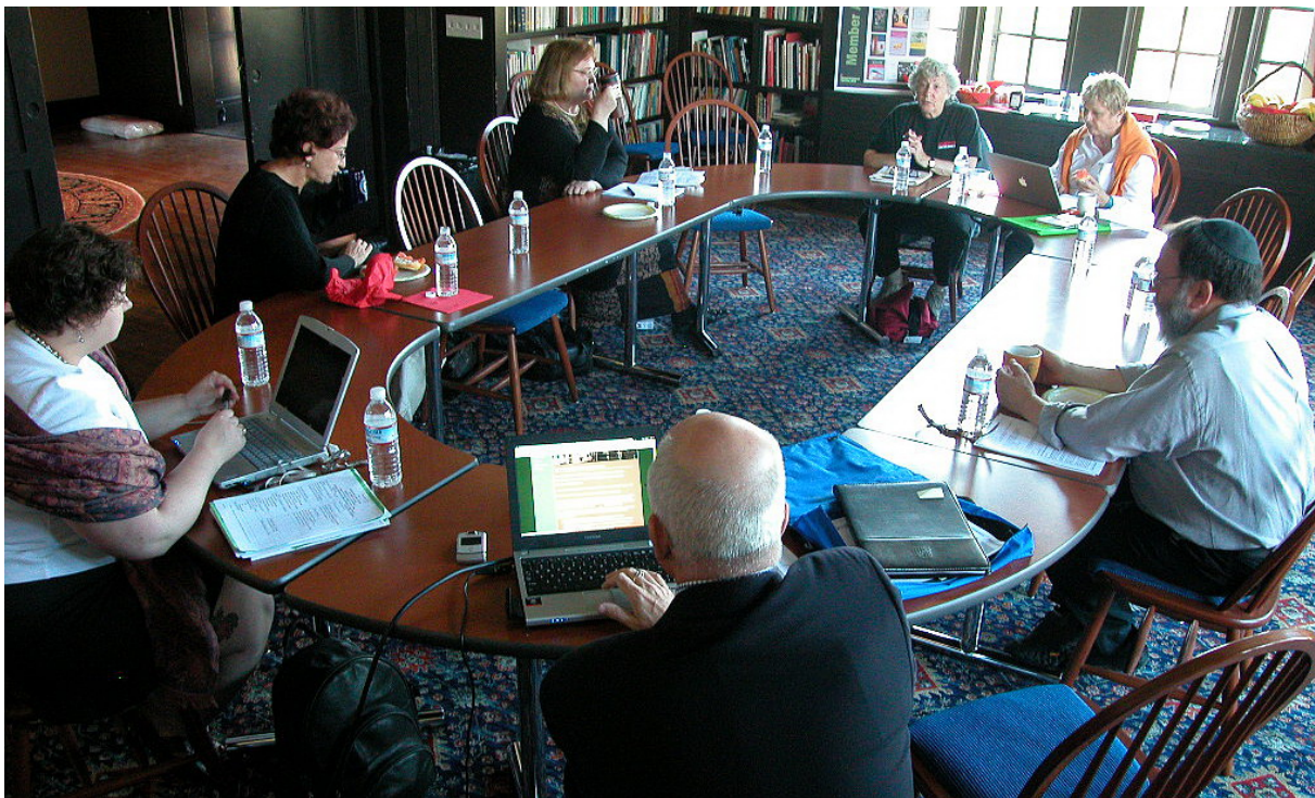
The NCIS Board meeting