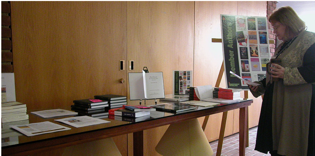
Displaying the publications of NCIS member authors