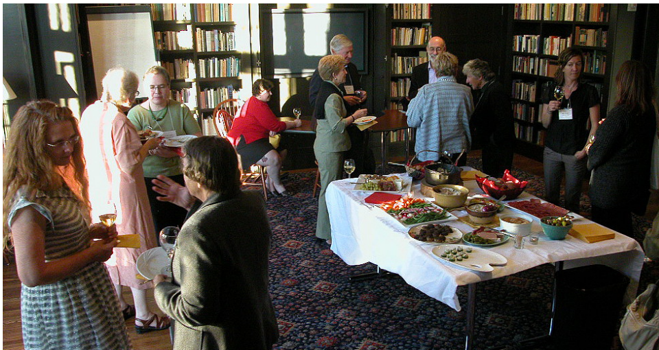
...to socializing and networking with fellow independent scholars. ❖