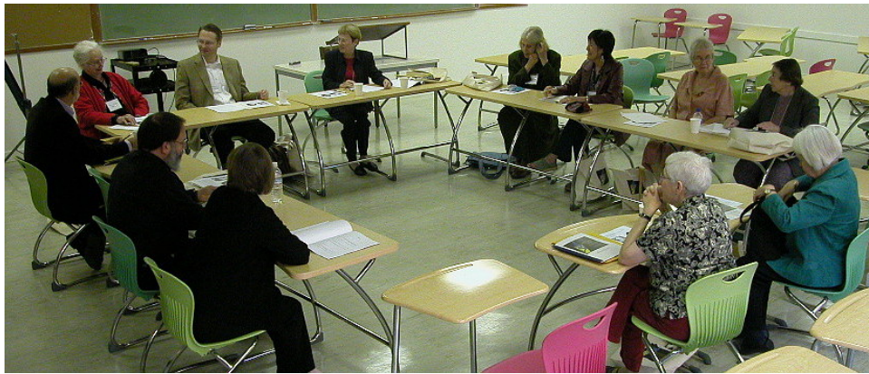
...to panels and presentations...