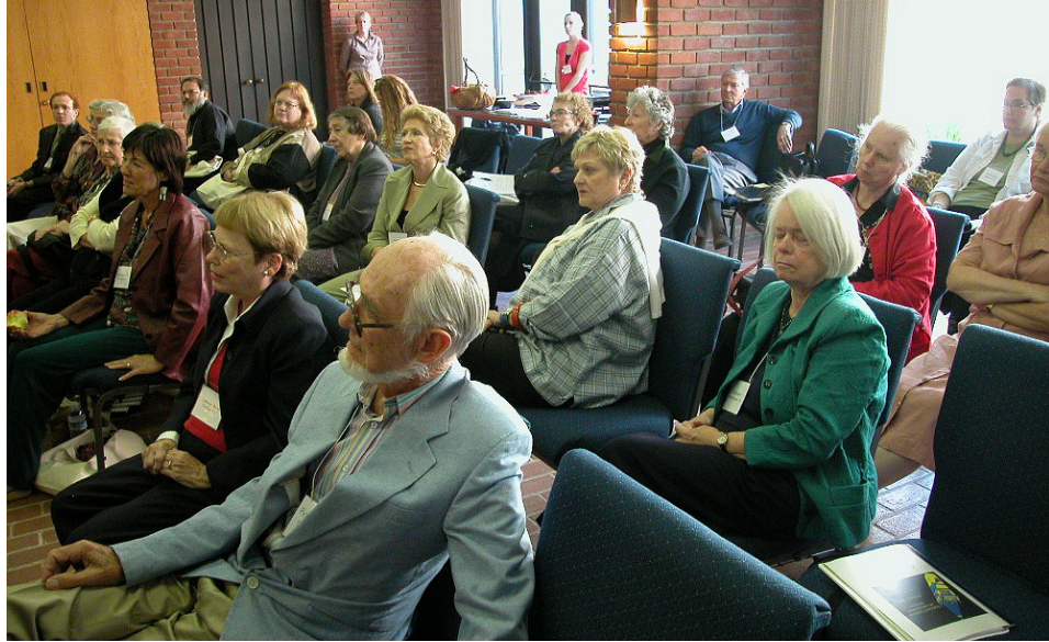
From plenary lectures...