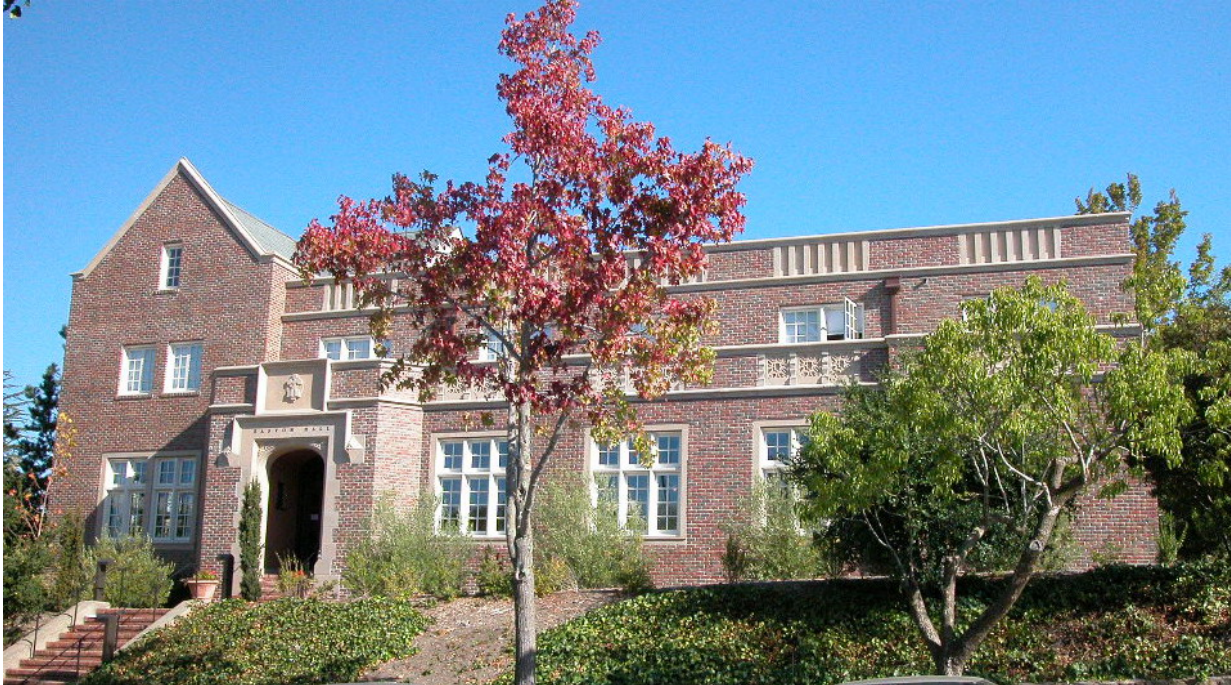
The Graduate Theological Union, UC Berkeley

The 2008 National Coalition of Independent Scholars conference and NCIS Board meeting was held on October 25 and 26, 2008, at the University of California, Berkeley.