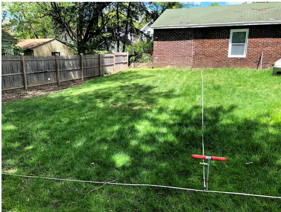
Figure 3: View of St. Oliver's Basilica site, looking north. Soil probe is located at 5 meters east of southwest corner.